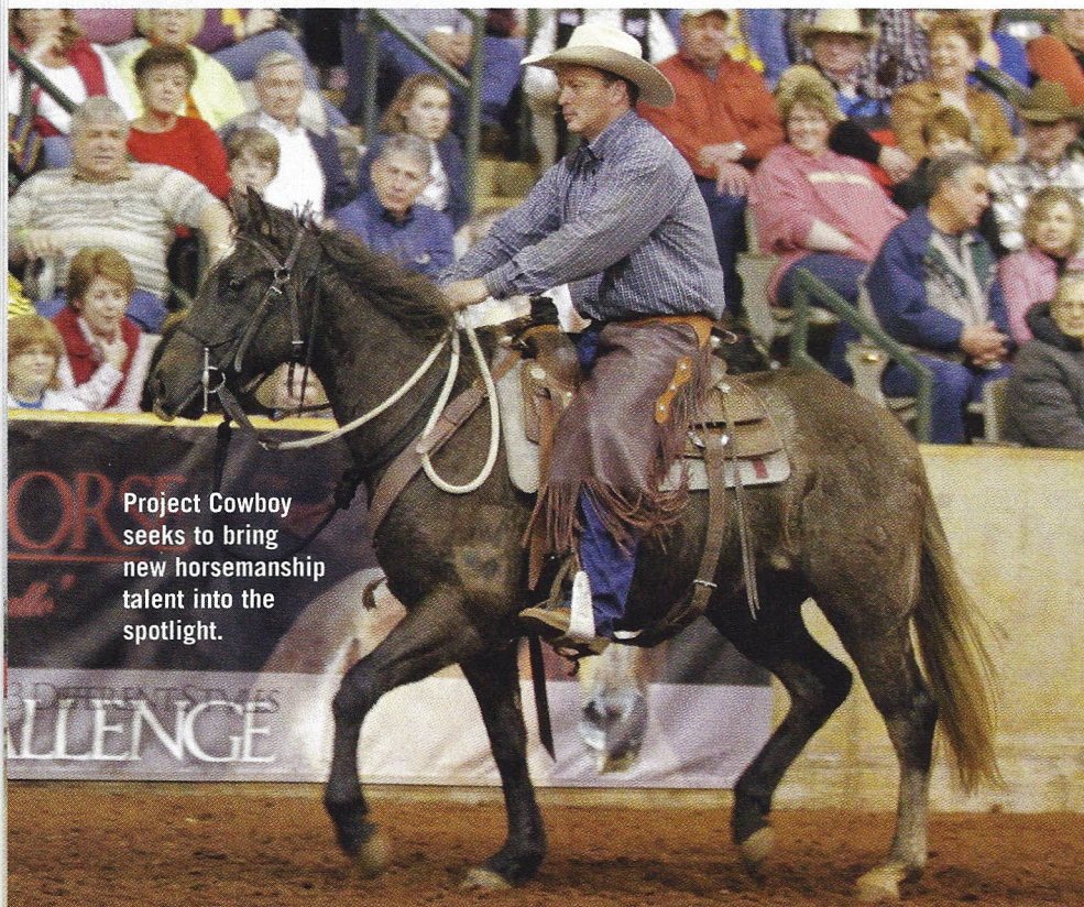
Project Cowboy seeks to bring new horsemanship talent into the spotlight.